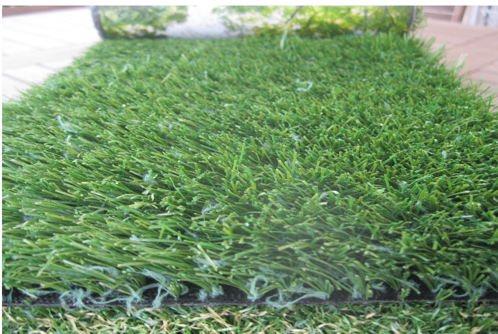
Nouwens Buffalo turf 30 mm