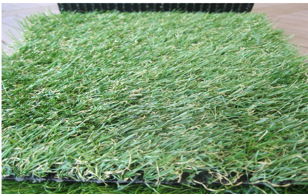
Nouwens Paspalum turf 30 mm