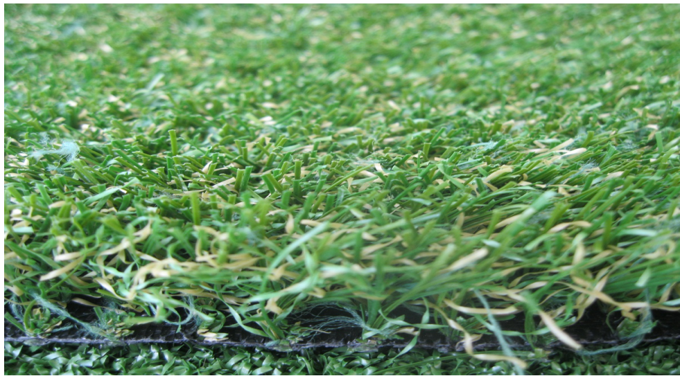
Nouwens Bermuda turf 30 mm