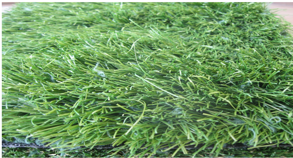
Nouwens Evergreen turf 40 mm