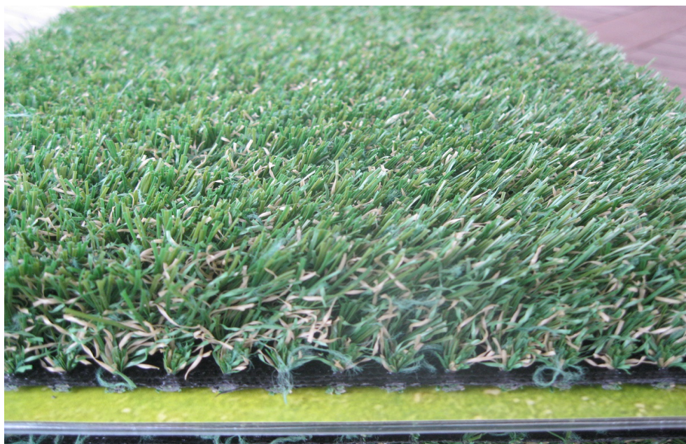
Nouwens Kikuyu turf 30 mm