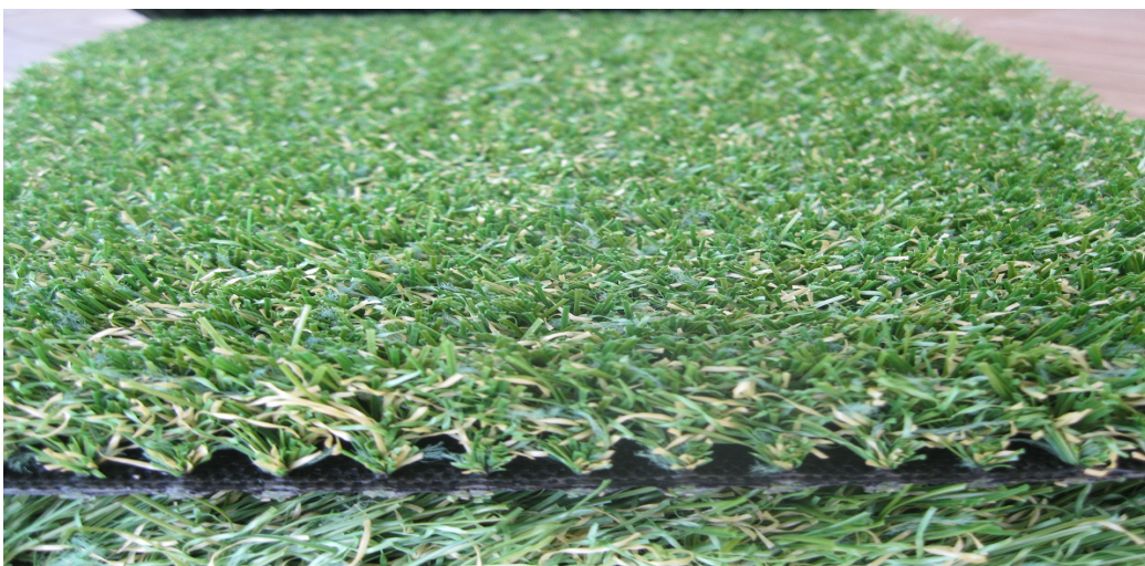
Nouwens Kentucky turf 20 mm